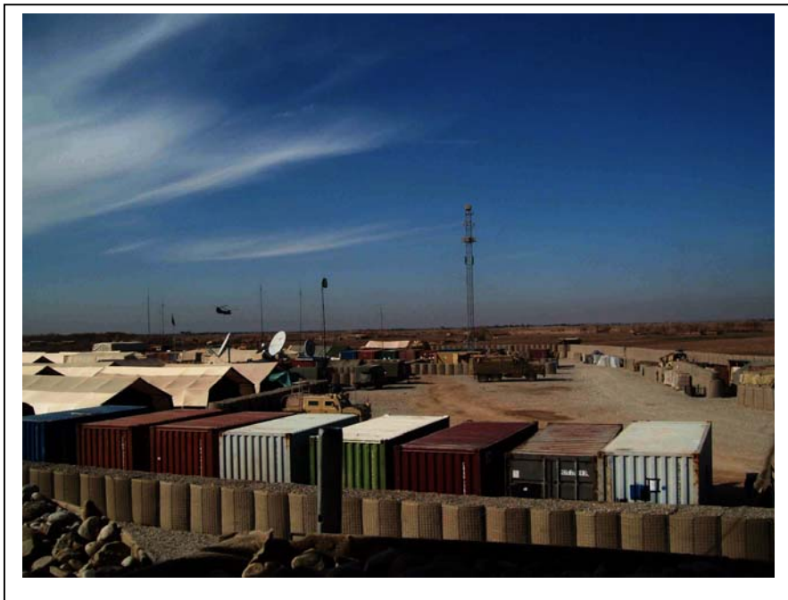
Battlegroup Babaji Patrol Base 2.

After spending the first half of my tour in affluent and salubrious Lashkar Gah, I was 'lucky' enough to be transported back in time to Patrol Base Two. PB2 is in the heart of Helmand province and is the headquarters of the Babaji Battle Group. On my arrival in the patrol base I was not only informed that I was to provide geographic support but I would also have to actually build the patrol base! Needless to say Geo work took a back seat and the erection of tents took centre stage. It's not that often that we Geo get to work closely with the mainstream Sappers,