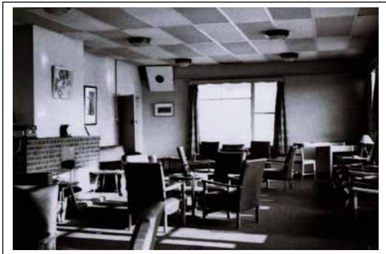
The Mess ante room of the early 1960s.