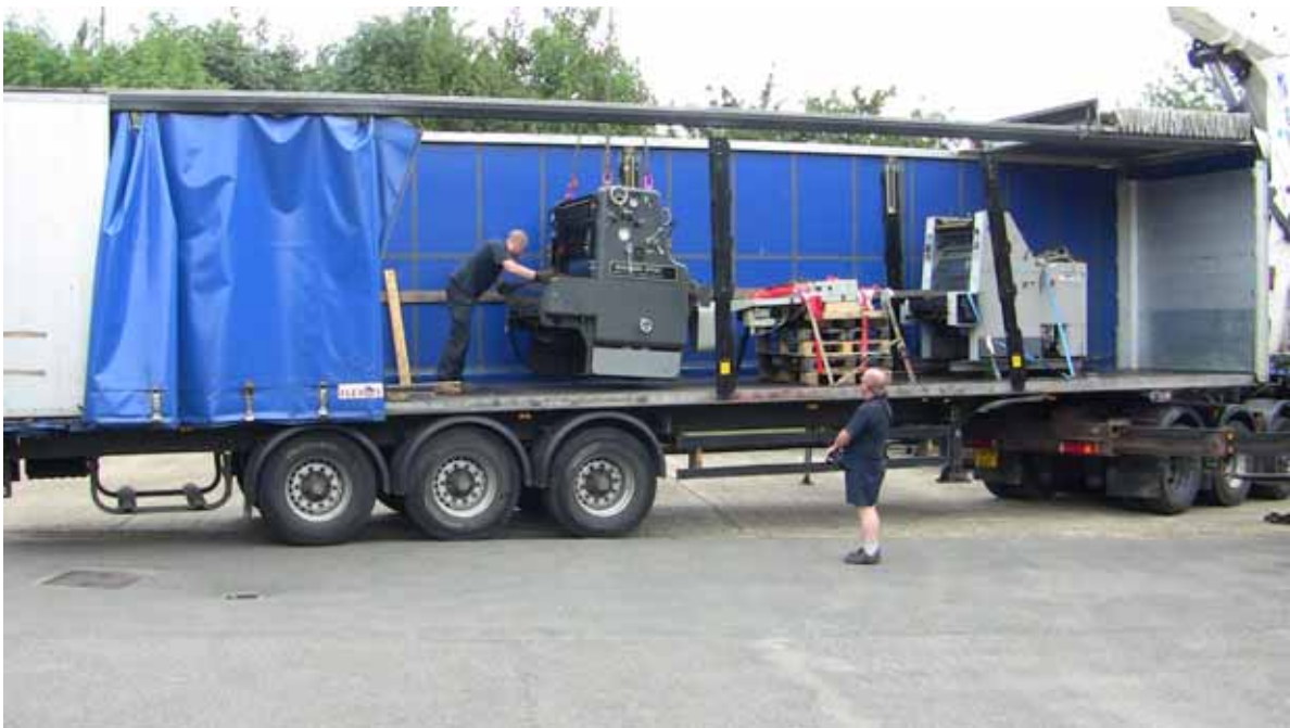
The last litho equipment from 42 Regiment on its way to a new life overseas.

The Squadron had not used the equipment in anger for some time and additionally direction had been given that lithography, as means of mass production, was to be no longer supported and other means would be introduced/the capability gap highlighted.