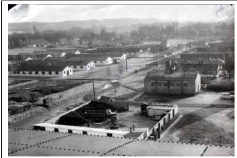
Hermitage in the 1950s.

Some time in the early summer of 1956, the whole of B Squadron of the School of Military Survey was transported to the range at Ogbourne St George for the annual shooting spree. It was probably May and the weather was glorious. So were the doughnuts and tea available from the mobile canteen, which (I think) was not a NAAFI truck but some other organisation, perhaps Toc H. The doughnuts were the best I've ever eaten.